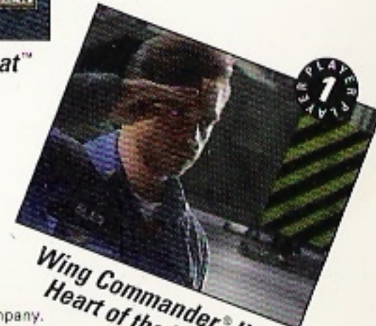
Wing Commander® III: Heart of the Tiger™